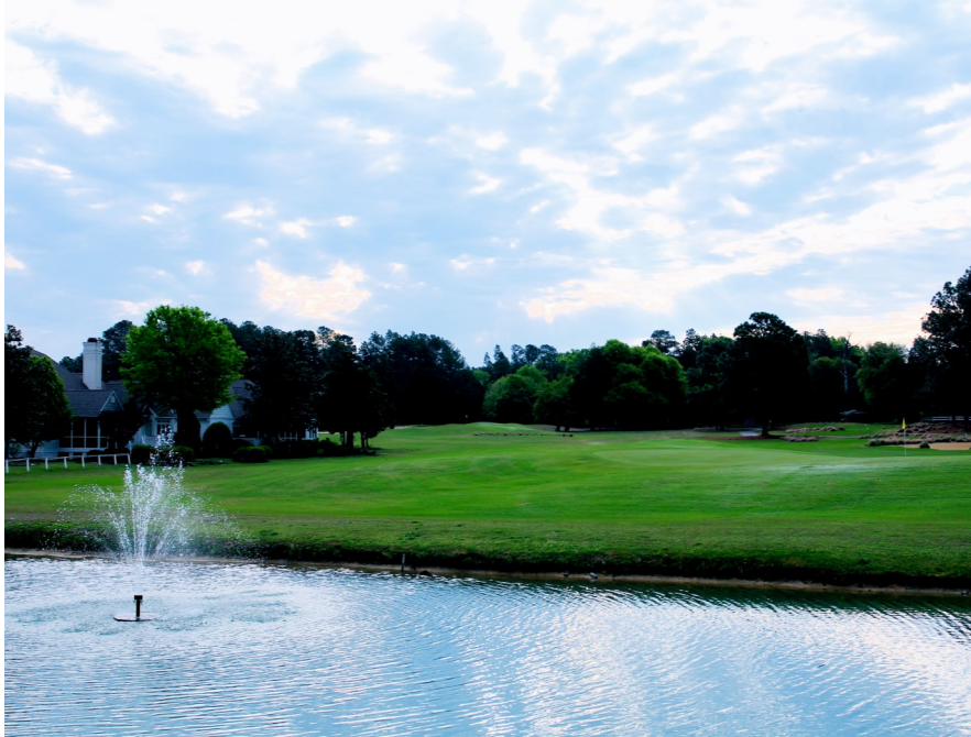
Just another day in the Home of American Golf®