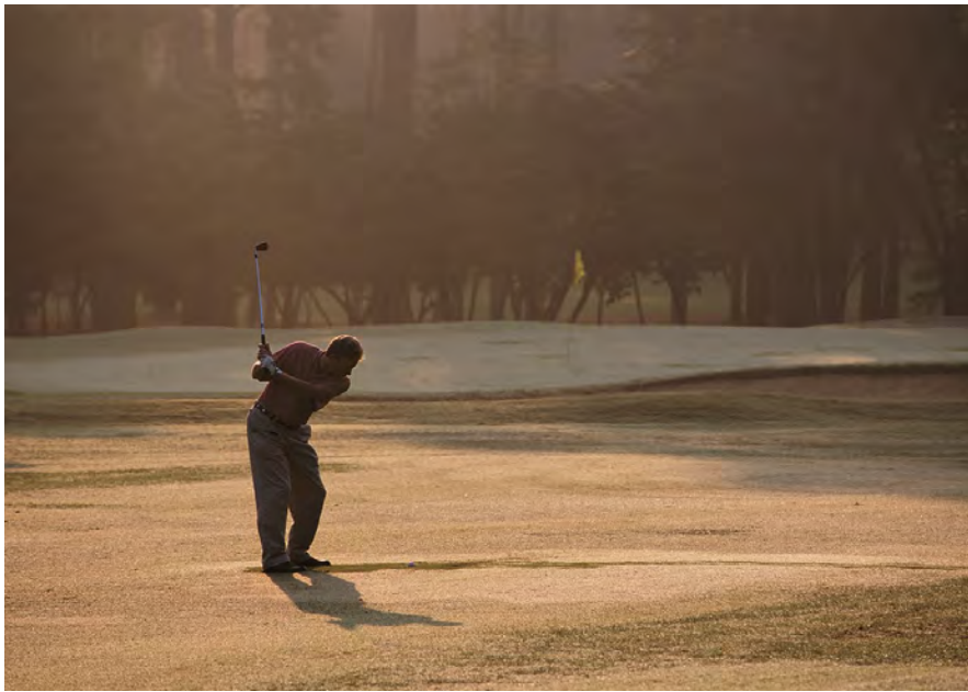
Just another day in the Home of American Golf®