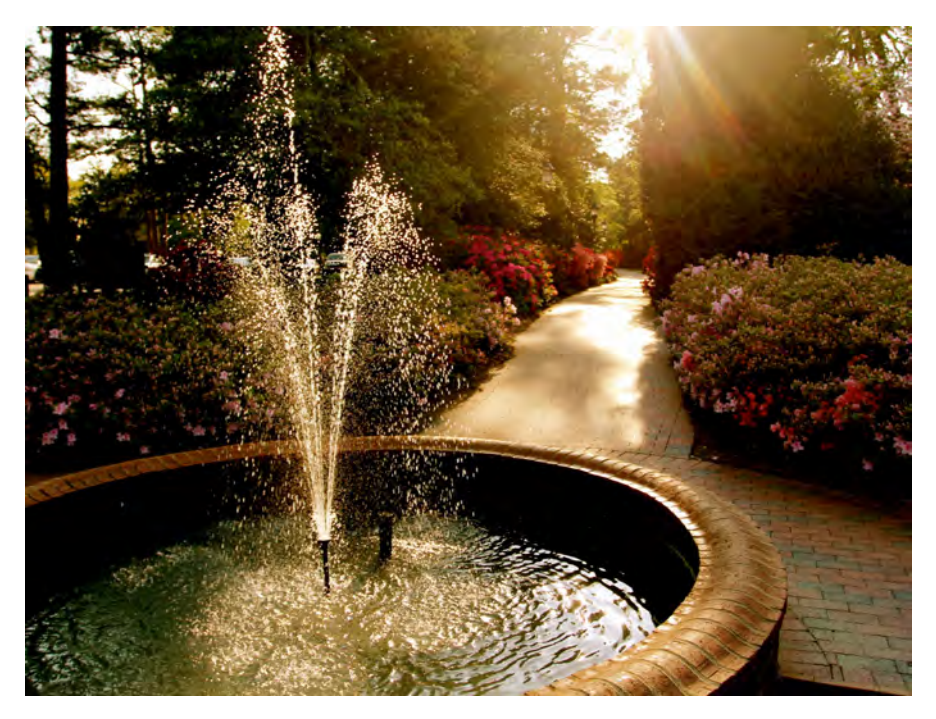
Just another day in the Home of American Golf®