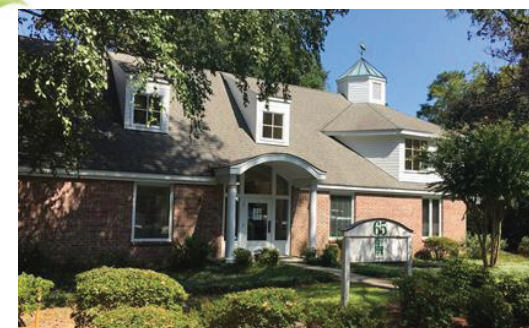
The CVB Office 65 Community Rd, Village of Pinehurst