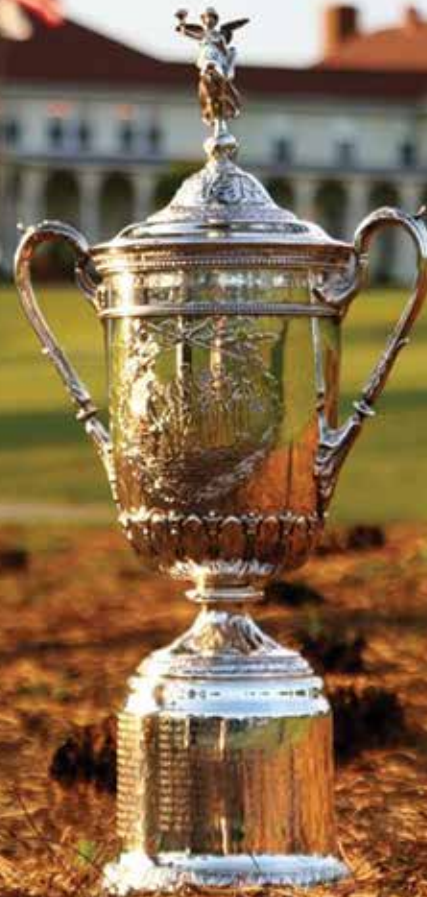
U.S. Open Championship Trophy at Pinehurst Resort