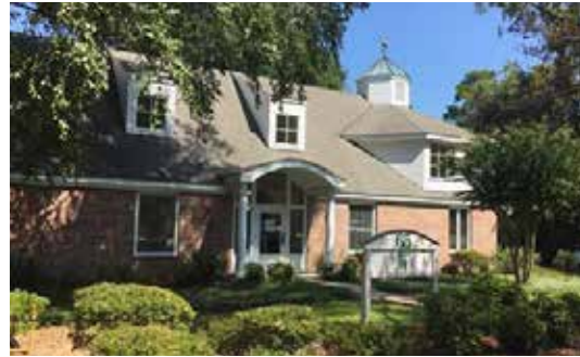
The CVB Office 65 Community Rd, Village of Pinehurst