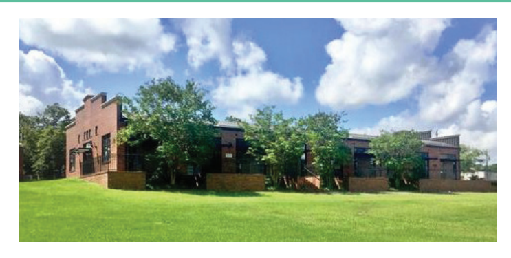
CVB Office 155 W. New York Avenue Suite 300 Southern Pines, NC 28387