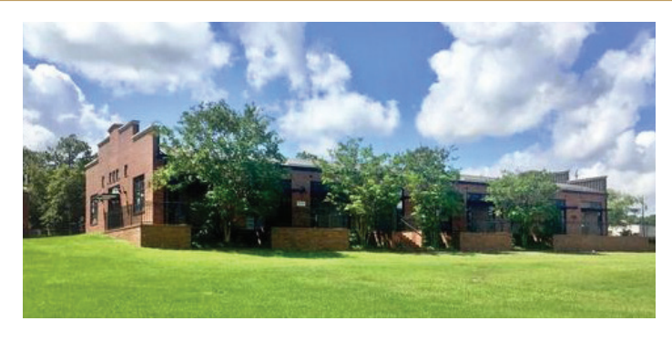
CVB Office 155 W. New York Avenue Suite 300 Southern Pines, NC 28387